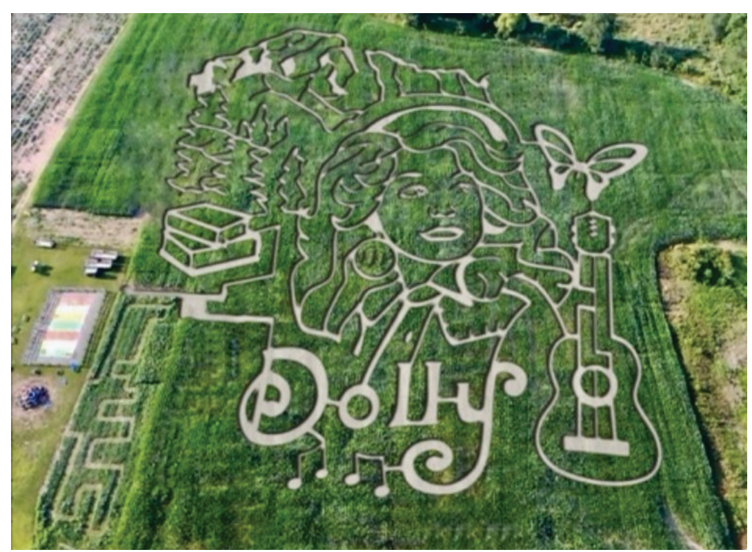
The Dolly Parton corn maze at Van Buren Acres.